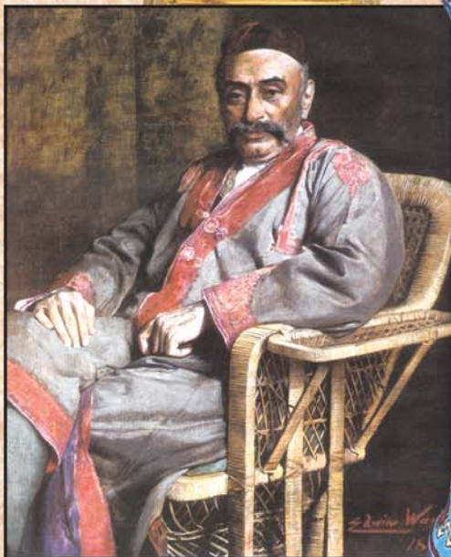
▲ Portrait of Jamsetji Tata by Edwin Ward, signed 1889