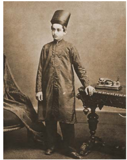
Educated in Bombay and England, Dorab Tata joined his father’s firm in 1887 at age 28

Christmas at his family home, when the plague struck, but — in a display of obligation and courage that came to characterise him — he returned to run the mill in this most trying of times.