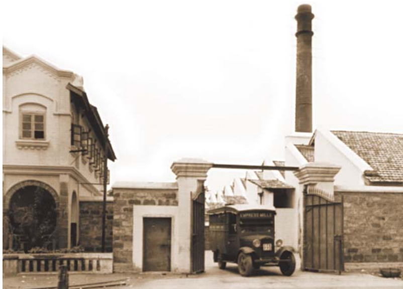
The Empress Mills, one of the earliest and biggest enterprises of the house of Tata

His views on India are best rendered in his own words, spoken on this occasion at a meeting of Tata Steel shareholders in 1918: “So far we have but scratched the surface of this great land... is it not time that all of us